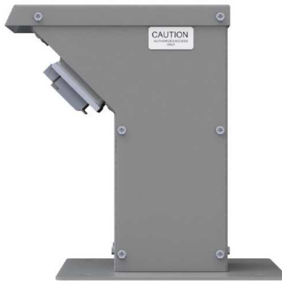
Single side pedestal shown